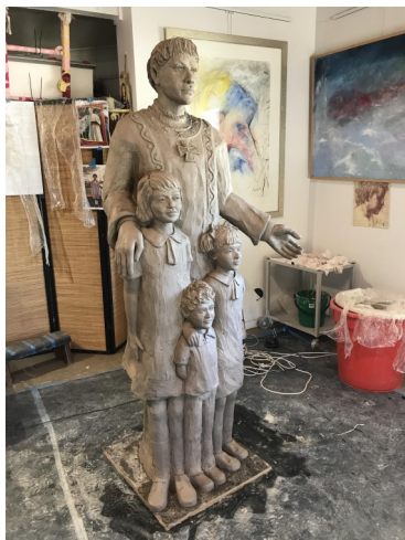
Clay mold for statue of Saint Lawrence.